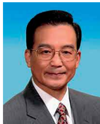
Premier Wen Jiabao’s family wealth was disclosed by international media. The media’s official website was immediately shut down in Mainland

When Wang Lijun went to the US Consulate in Chengdu, all relevant information was heavily censored over the internet. Whenever a blogger posted or disseminated a message on the internet, it was immediately deleted by the internet service provider. Therefore bloggers started to use an indirect word to represent the case, which is a common practice for Chinese bloggers when they communicate about sensitive issues. Unfortunately it was difficult to get through the censorship system. Active bloggers found that their accounts could be suddenly suspended without knowing the reason or being given prior notification by the service