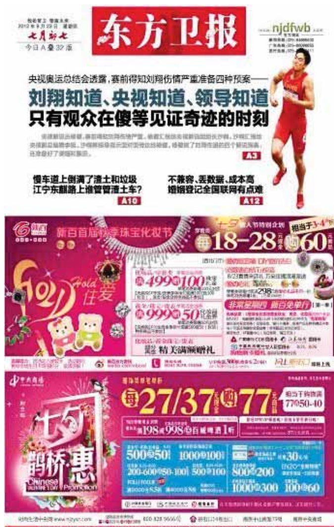
A directive was issued to media when reporting Olympic athlete Liu Xiang on August 7 that no negative reporting should be made – photo capture from online

as the Deputy Director of Shanghai Catholic Patriotic Association was removed by the Standing Committee of the Chinese Catholic Patriotic Association without any explanation being given.