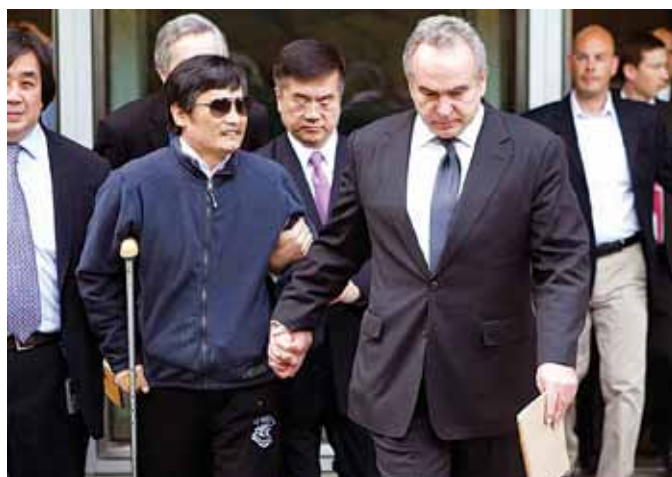
Blind activist Chen Guangcheng escaped from house arrest and fled to the US Consulate in Beijing

Since he organised a class-action against the authorities in Linyi, Shangdong, in 2005, Chen has faced tremendous hardship including physical attacks, threats and house