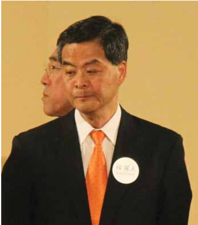
In Chief Executive Election and Legislative Council Election of 2012, media received tremendous politics influence.

Advocates for press freedom in Hong Kong are vigilant, in particular during and after the campaign for the new Chief Executive of Hong Kong. During the bruising campaign at the beginning of 2012, two out of the three candidates – the former convenor of the Executive Council, Leung Chun-Ying, and the former Secretary of Hong Kong Government, Henry Tang – competed fiercely with each other. Some members of the media lost their impartiality, choosing to support only one of these two major candidates, but the role of the Hong Kong Government also came under scrutiny. On February 8, the Hong Kong Government issued a press statement saying that Leung had failed to declare a conflict of interest in a tender process for the West Kowloon Cultural Hub 10 years ago. When Hong Kong's media queried why this information had been released now, more than 10 years after the event, the spokesperson explained that the information was released in response to a request from the media. However,