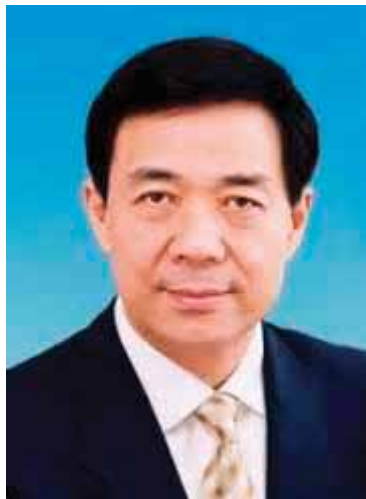
Former Chongqing Communist Party Secretary Bo Xilai scandal became one of the reasons to punish media in the "Ice Age".

For China's media, the year 2012 can be described as a prolongation of the "Ice Age" of 2011. It is rare to read an in-depth investigative news report in China. At the same time, more than a dozen orders were issued daily, imposing significant restrictions on the media's efforts to fulfill their role as watchdogs. This "Ice Age" included various dramatic incidents. These included the expulsion of Bo Xilai, described as the "princeling" of Chinese politics, from the Communist Party after Wang Lijun, Police Chief and Vice-Mayor of Chongqing, fled to the US Consulate in Chengdu in February; the successful escape of blind human rights lawyer Chen Guangcheng from year-long house arrest and his flight to the US Consulate in Beijing in April; the first democratic election in Wukan Village, Guangdong Province, in February; an incident springing from the long-running ownership dispute over the Diaoyu Islands (also known as the Senkaku Islands) in September; and the 18 th National Congress in November, which changed the membership of the Politburo Standing Committee of the Communist Party of China.