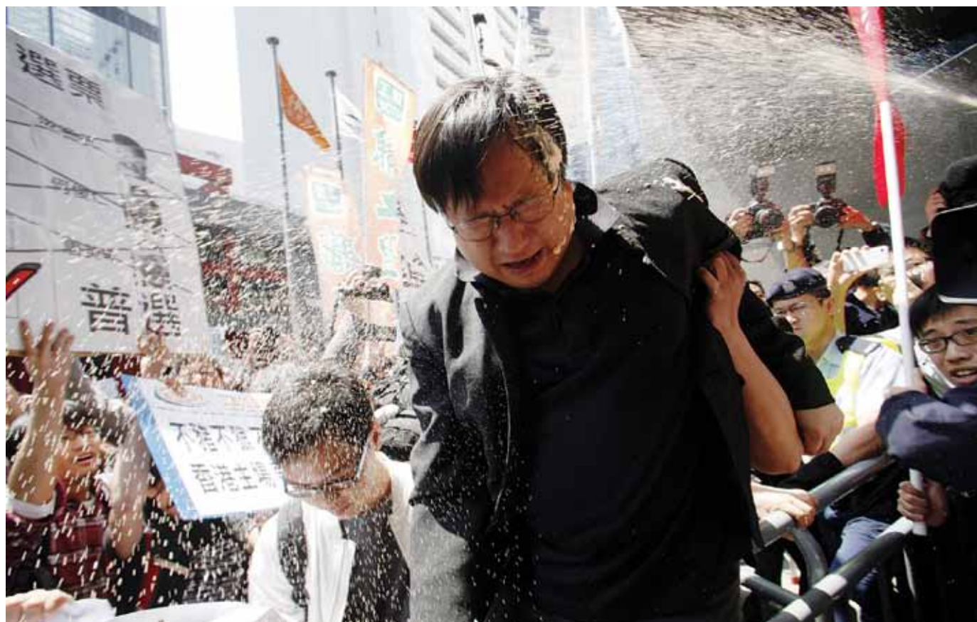
Police commonly used pepper spray towards protestors when demonstrations were targeting Chinese Liaison Office, Central Government agent in Hong Kong and Hong Kong Election.