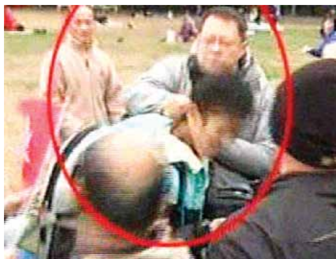
Now cameraman was punched by a protester in a rally of pro-government demonstration in Hong Kong.

against perceived interference by China in the election. Again, police used pepper spray. Several media persons were affected and movement was limited due to the police designation of a media zone which limited the ability of journalists to exercise their duties.