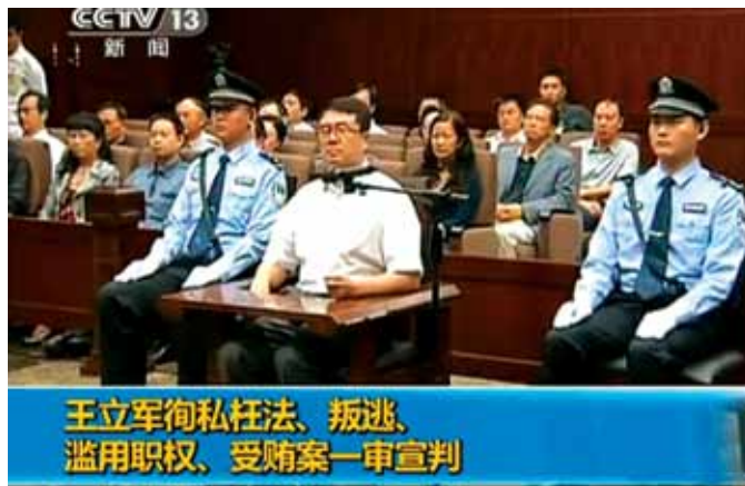
Wang Lijun, former Chief of Police in Chongqing, fled to US Consulate in Chengdu, found guilty after trial but no independent media were allowed to attend the hearing.

social issues, such as the anniversary of the deadly high-speed train crash in 2011 in Wenzhou in China's eastern Zhejiang Province.