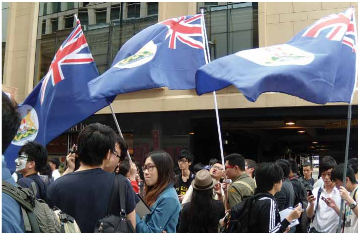
Protesters waved the British colonial flag in a demonstration, drawing the attention of the Central Government, which warned “beware of external powers”. This sparked public concern over whether the government was preparing to enact Article 23.