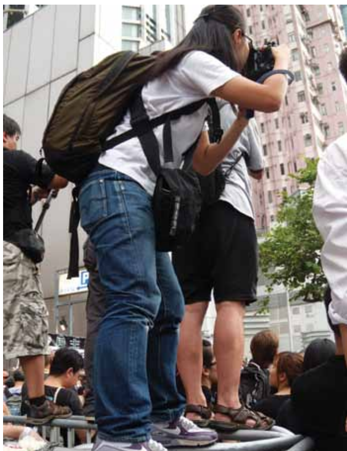
Since police of Hong Kong is heavily limiting space for media to move in front of Chinese Liaison Office , photographers have to put themselves in danger in order to take a good image.