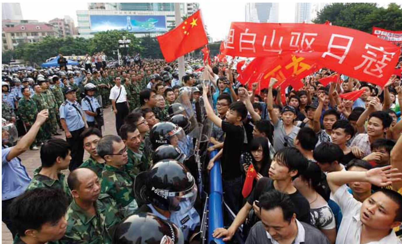
Diaoyu Islands (Senkaku Islands) disputes sparked series of protests in Mainland

and a Hong Kong journalist were reportedly beaten up when they took photos of a rally.