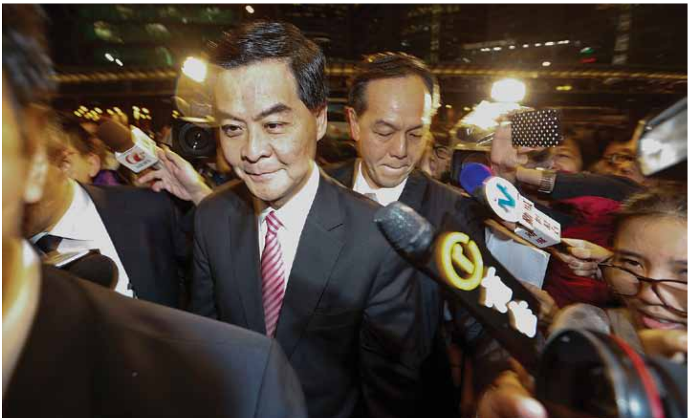
Leung Chun-Ying, Chief Executive of Hong Kong commonly uses an evasive manner towards media when controversial issues break out.

In July 2012, Leung was chosen as the Chief Executive of Hong Kong by 1200 nominated elective committee members. He then appointed his new cabinet team. Unfortunately, several of the cabinet members were revealed by the media to have been involved in different