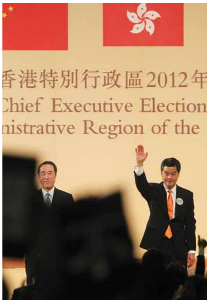
25 March 2012, Leung Chun-Ying won 698 votes out of 1200 votes to become the Chief Executive of Hong Kong in the election.

The year 2012 was difficult for the media in Hong Kong, with journalists at risk of punishment for raising questions and of criminal prosecution for carrying out their duties. However, the most concerning situation was that the new government of the Hong Kong Special Administrative Region seemed to deviate from its long-standing administrative good practice. HK Chief Executive, Leung Chun-Ying, avoided explaining directly to the public about an illegal structure in his house. The Secretary of Education and the Commissioner of Police ignored their responsibilities to report to the public when they made their official visits to Beijing. Furthermore, Zhang Xiaoming, Deputy Director of the State Council's Hong Kong and Macau Affairs, called for Hong Kong to pass the national security law required by Article 23 of the Basic Law which, it is widely believed, could jeopardise press freedom and freedom of assembly. In 2003, the then Chief