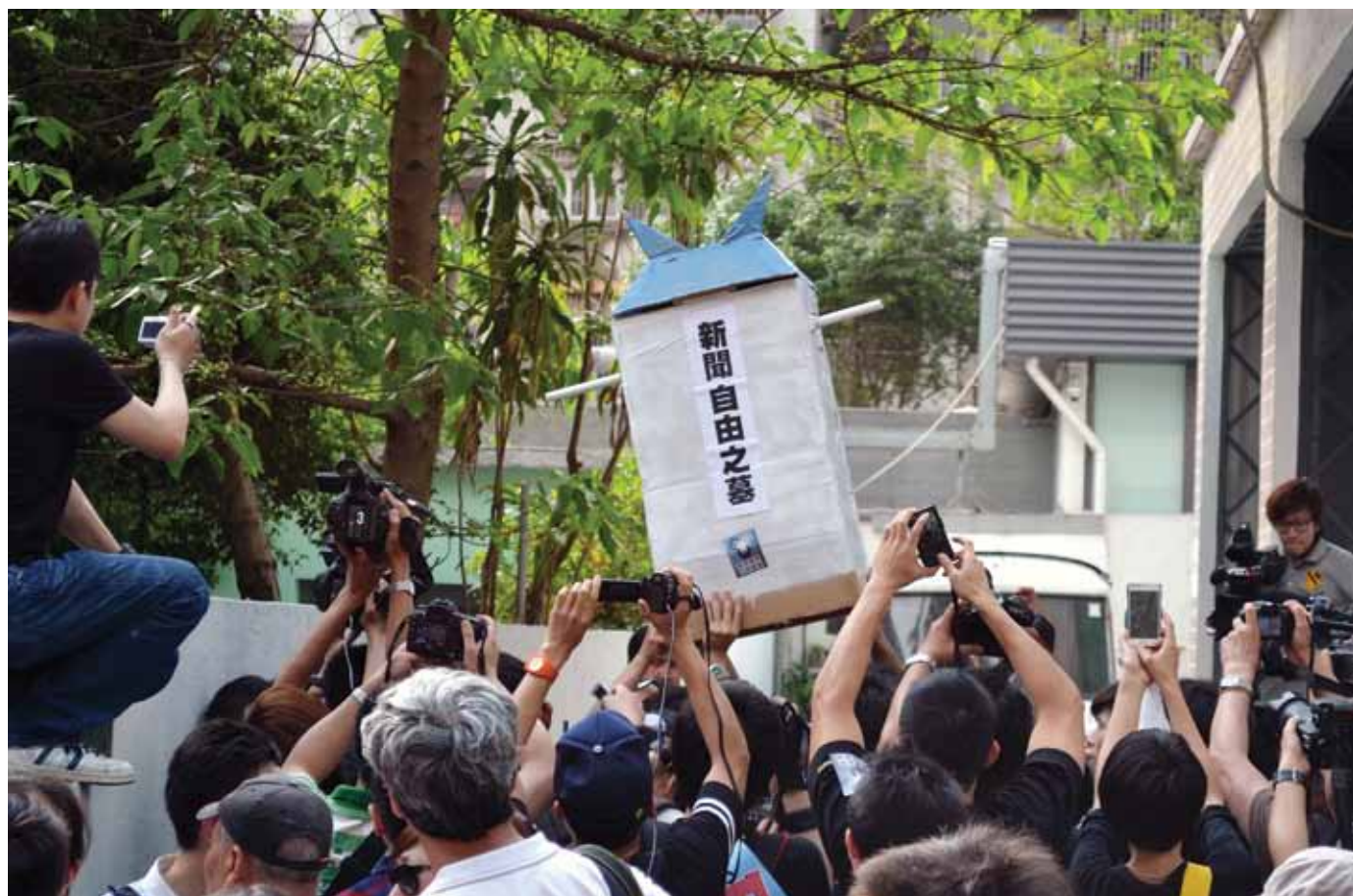
Hundreds of Macau journalists protested self-censored in media industry of Macau is escalating .

was needed because the laws had lain dormant for over 20 years and had not been implemented. According to the relevant law, a press council should be set up. A deliberative poll was conducted within the industry and the general public.