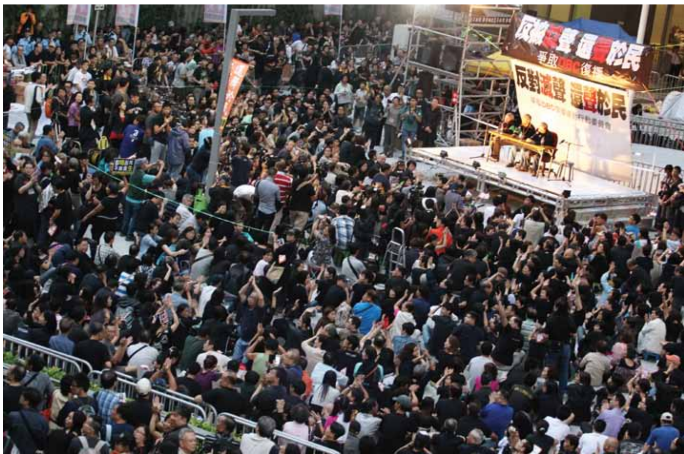
Digital Broadcasting Radio host claimed the station was suffering from political interference. Staff and the public protested in front of the Hong Kong Government HQ.

difficulties in the course of their work, sometimes even suffering harassment or assault.