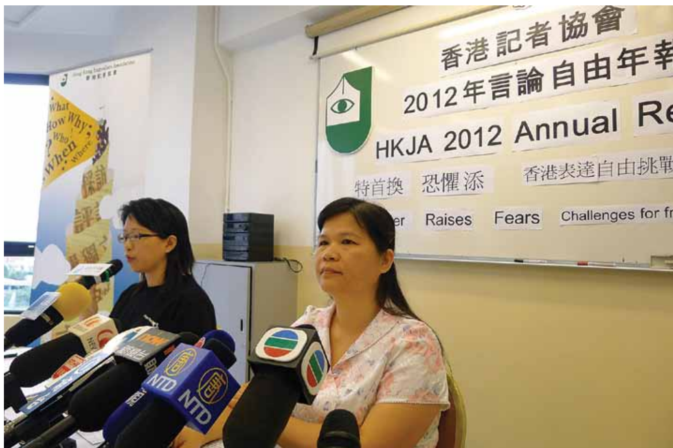
Hong Kong Journalists conducted a survey and found out almost 60 per cent of respondents thought that press freedom would be restricted under Mr. Leung’s administration.

The IFJ discovered that the Chinese Liaison Office directly interfered with the media when the Legislative Council election was held in September. The Office