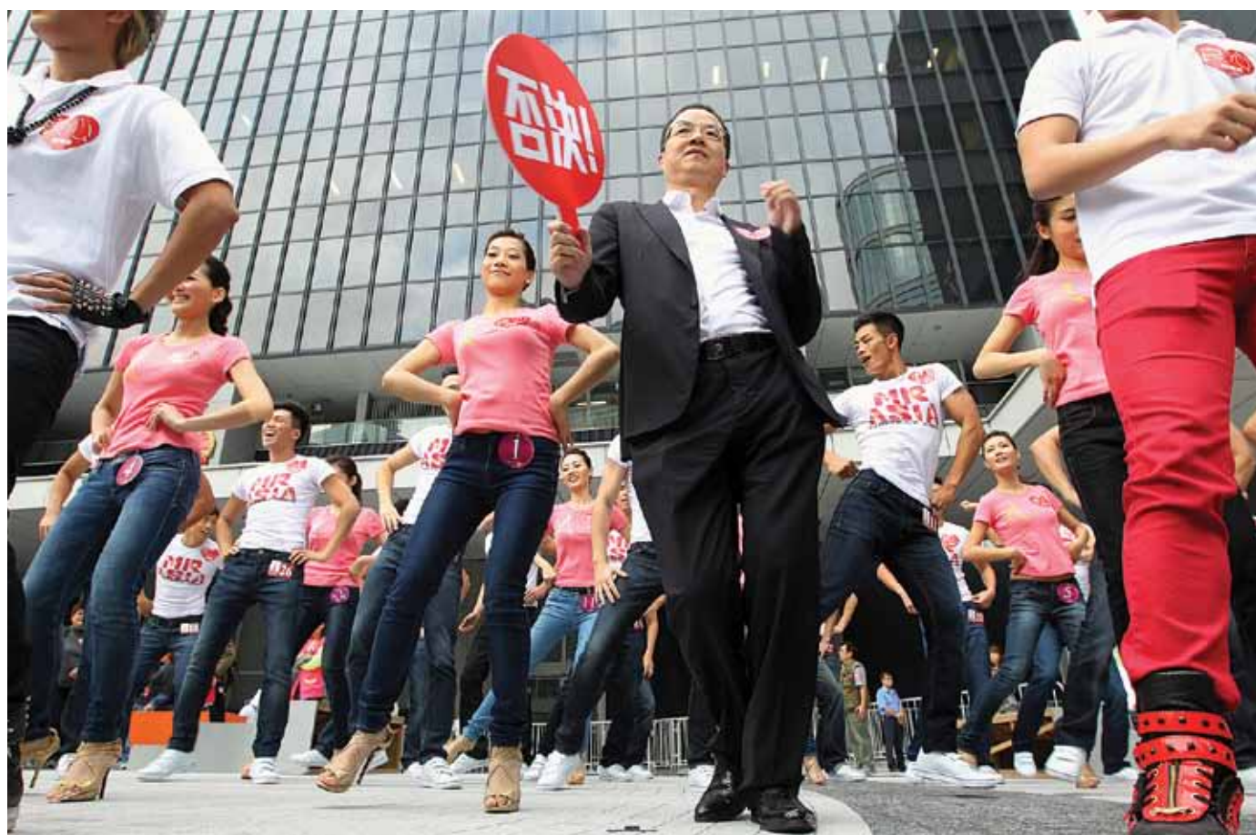
Asia Television of Hong Kong protested outside Hong Kong Government Headquarters to oppose another new free-to-air television license in the market.

Wong urged the government to issue the licence and said he would bear all the legal challenges. At the same time, Wong also threatened that he would take legal action if the government kept on delaying the application. Another applicant, i-Cable Communications, also a pay-TV operator in Hong Kong, urged the government to issue a temporary licence instead of a permanent licence.