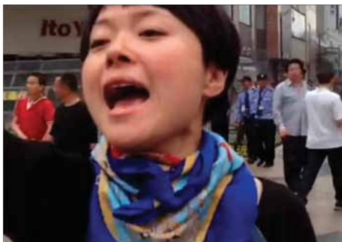
A unidentified lady suddenly accused a Hong Kong journalist of stealing her things when he was trying to take photos outside the court. When police blocked the journalist, the lady secretly left – photo of Hong Kong journalist.

During the 17 th National People’s Congress in March, when Bo Xilai was still in the position of Party Secretary of Chongqing, Chongqing Province also invited media personnel to attend the meeting. However, the invitation was not open to all media. Many journalists were crowded around outside the meeting room. The IFJ was told that several Mainland journalists were warned not to raise embarrassing questions, though the kinds of questions they were not allowed to ask were not specified. It is reasonable to suppose that no questions relating to the Bo scandal were permitted.