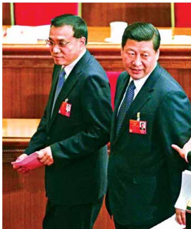
While the 18th National Congress was coming, online censorship was escalating. Xi Jinping and Li Keqiang were elected as members of the Central Politburo Standing Committee of Chinese Communist Party

The year 2012 was a very sensitive period for the Communist Party because the leadership was scheduled to change. Before the 18 th National Congress was held, the 17 th National People's Congress and the Chinese People's Political Consultative Conference were held on March 3 and 5 respectively. Restrictive orders were issued by the Central Propaganda Department to all media outlets as usual. According to a report by China Digital Times , all media outlets were forbidden from reporting on any appeals made to the Central Government or any