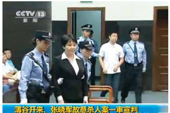
Gu Kailai, wife of Bo Xilai, found guilty of murdering British businessman.

During the hearings of Gu Kailai and four other people in August and Wang Lijun's trial in September, no individual journalists were allowed to enter except those from the state-owned media, Xinhua News Agency and Central China Television. Media on the Mainland were ordered to republish Xinhua's report with the exact number of articles and the headings. All non-local media, including Overseas, Hong Kong, Taiwan and Macau media, were ordered to stay in a designated media zone and not allowed to leave it. The media zone was far away from the court room, and they were barely able to see or interview relevant persons.